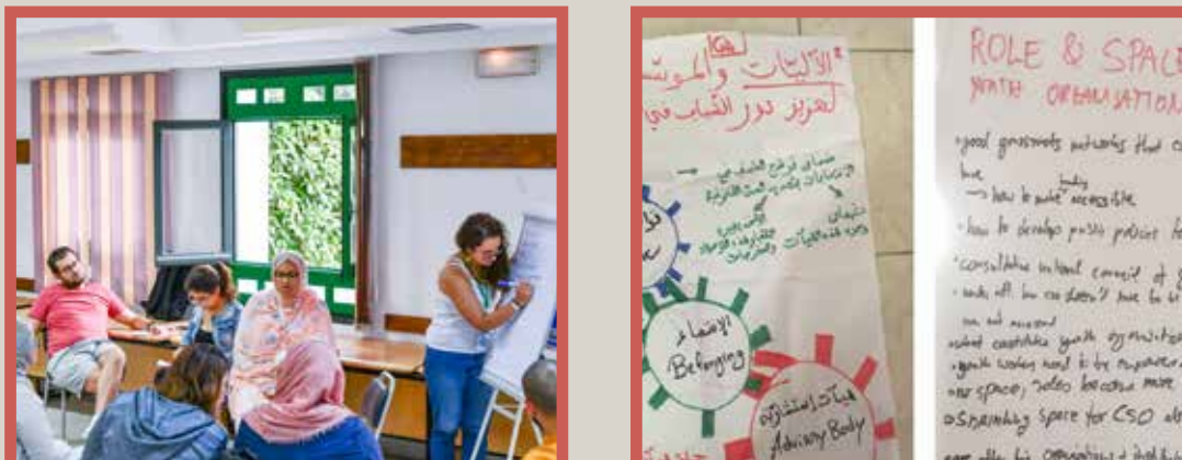
FOCUS GROUP DISCUSSION ON BROADENING THE SPACE FOR YPS, TUNISIA

Therefore, the importance of the YPS agenda and recognising the significance of youth agency is not hidden from decisionmakers, including Tunisian authorities. Yet, young people, including myself, wonder how much more time, research and resilience is needed before governments, such as the current Tunisian government, go beyond lip service and take it upon themselves to make youth-inclusive policies and engage young people where they rightfully have a say and influence: at the decision-making level.