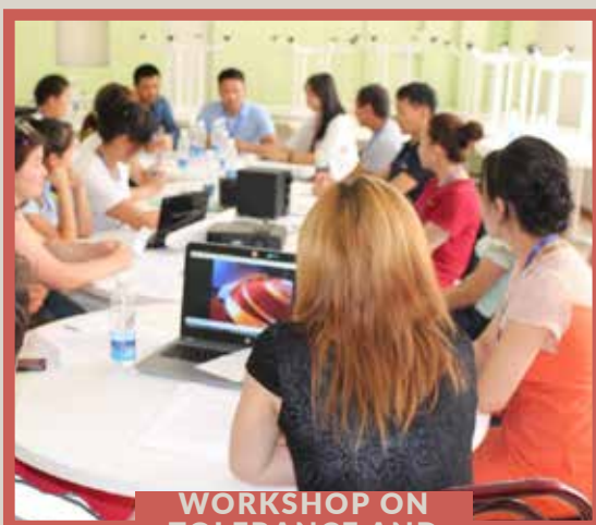
WORKSHOP ON TOLERANCE AND DEMOCRACY