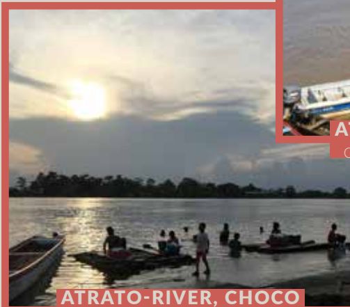
ATRATO-RIVER, CHOCO