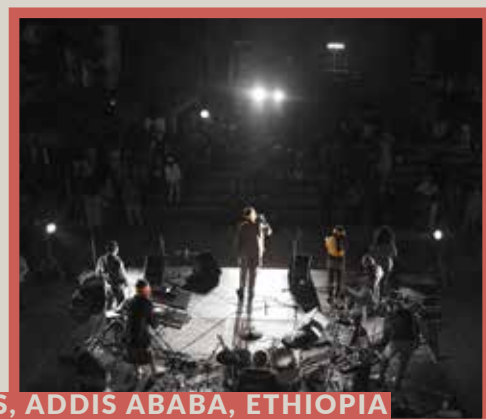
FOURTH ARTS 4 PEACE CONCERTS, ADDIS ABABA, ETHIOPIA