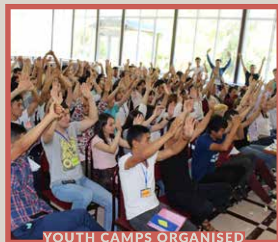
YOUTH CAMPS ORGANISED BY SAFERWORLD