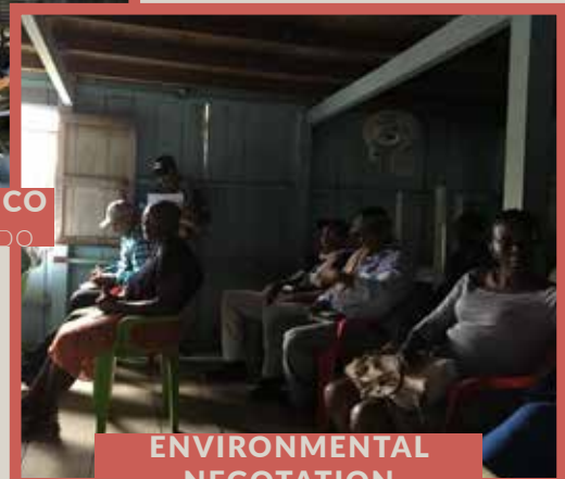
ENVIRONMENTAL NEGOTIATION